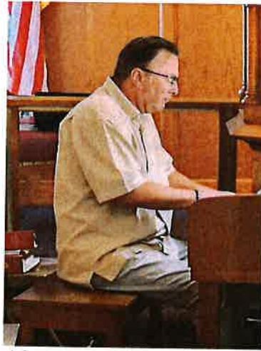
Oleg Rudnytsky on piano