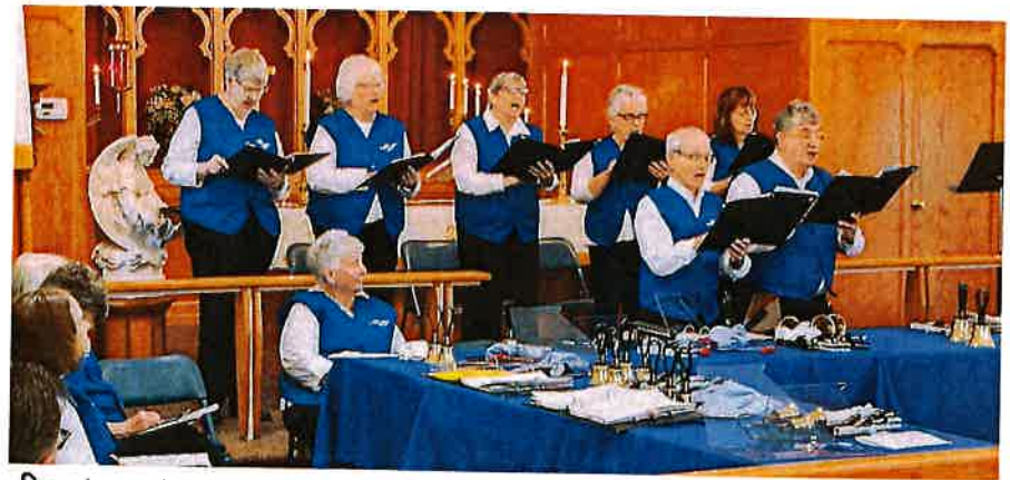
Senior Choir performing one of their many songs