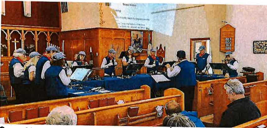
Bell Choir performing 'This Train'